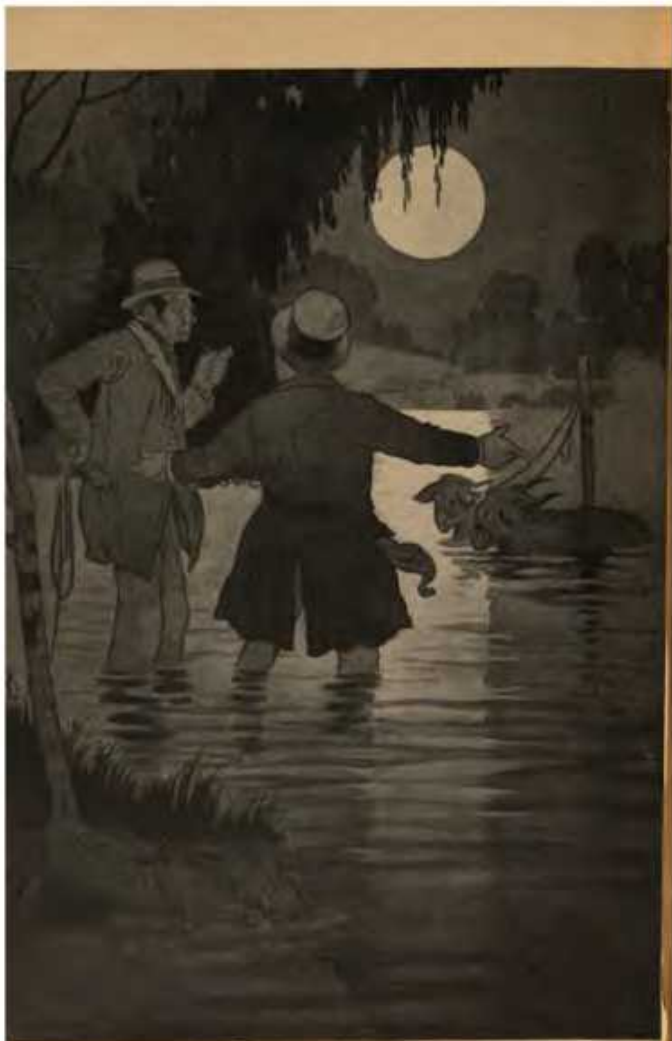
They anchored the water goats firmly in the lake