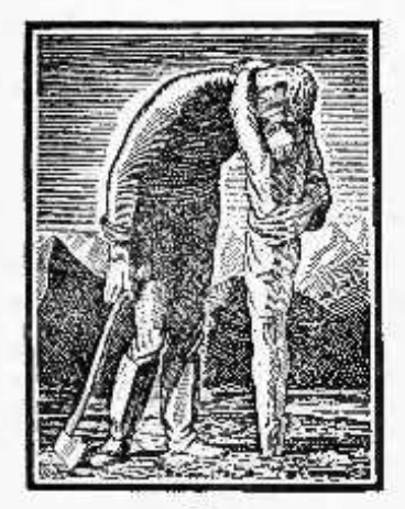
To old L. M. Olson and young Rockwell Kent of Fox Island this journal is respectfully dedicated