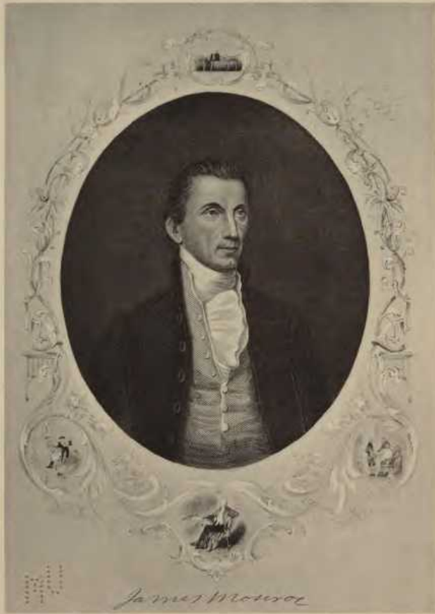
James Monroe, after whom Monroe Street was named