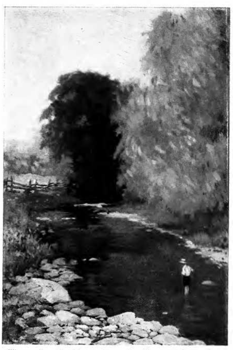
The goodly plain things—the smells, sights, sounds, touches and tastes of the country