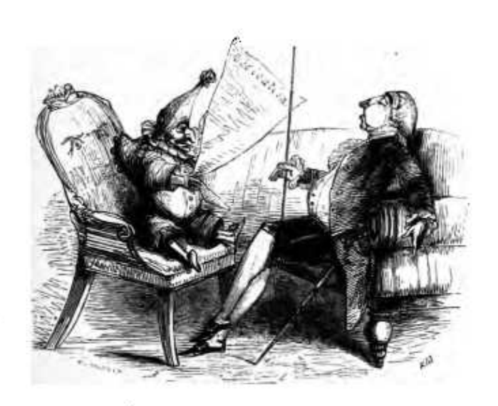
PUNCH READING HIS DEDICATION.