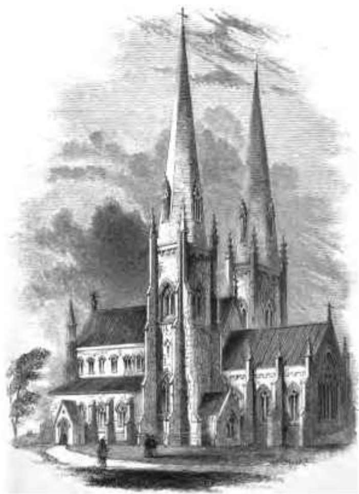
FREDERICTON CATHEDRAL, In course of erection.