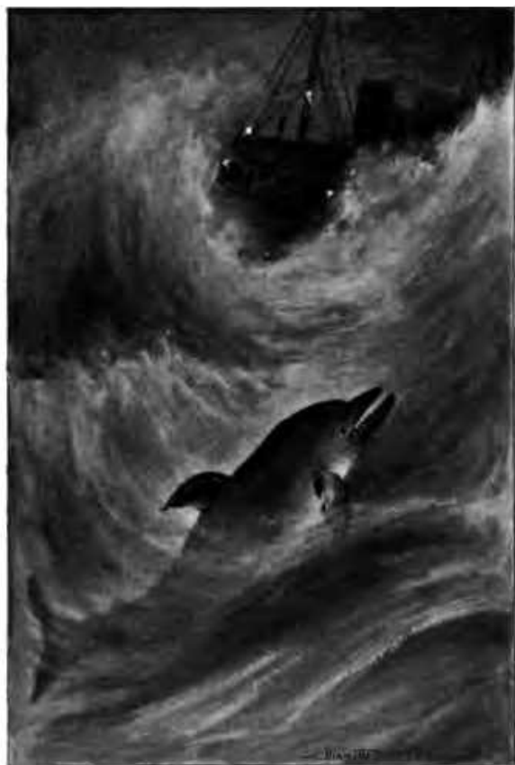
"A GREAT VESSEL WAS STRAINING AND TUGGING, AND I COULD SEE LIGHTS"