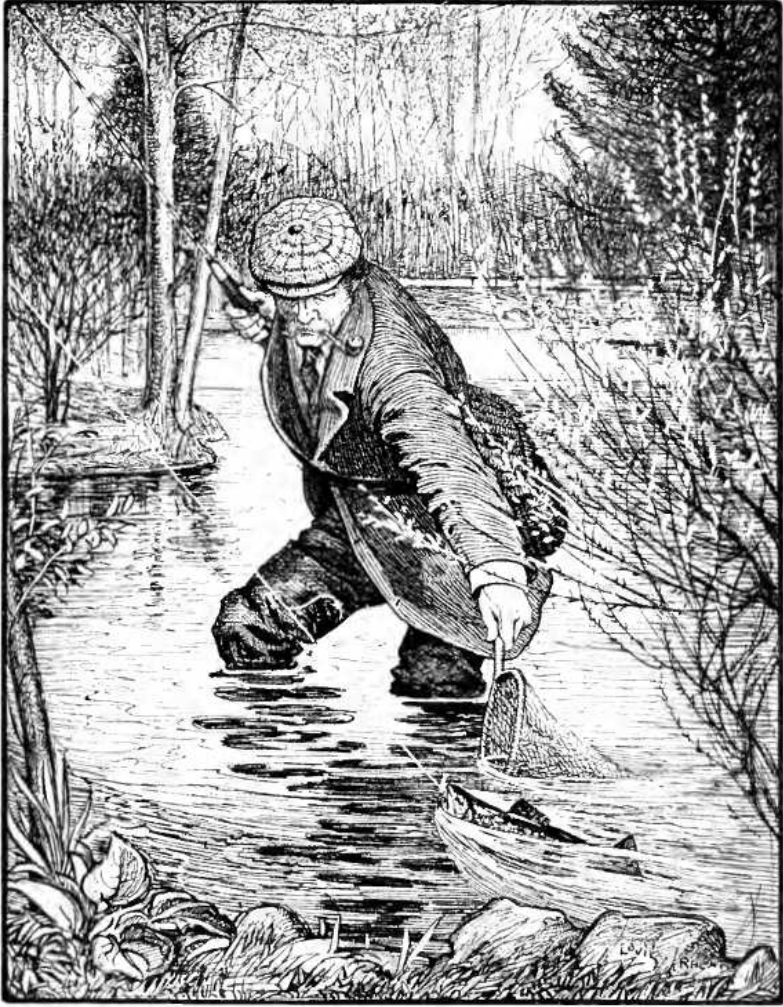
When the pussy-willows bloom