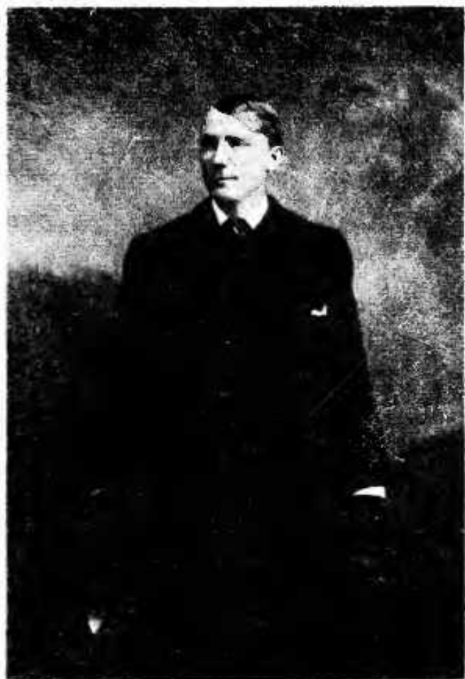
James Whitcomb Riley

From a photograph taken at the age of twenty-six