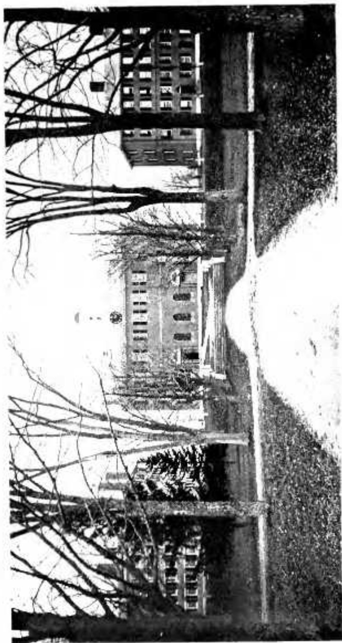
SEMINARY BUILDING-S (1870)