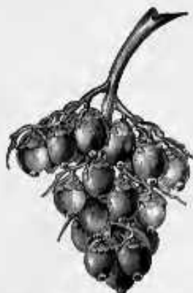
'The arrowy betel-palm with its golden egg-like nuts.' Crozier of the Maroons