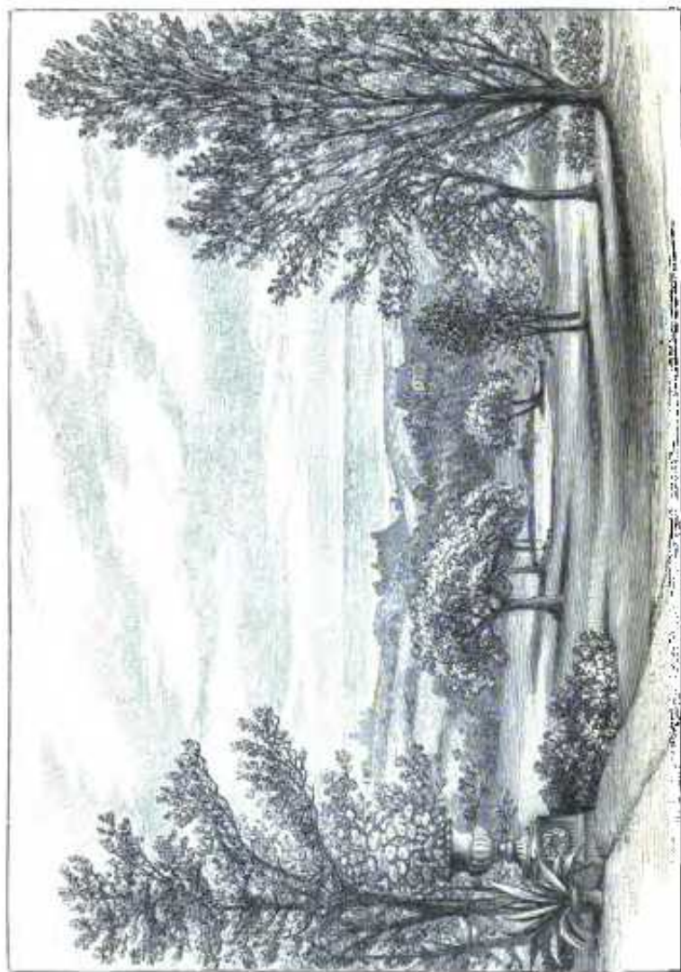
VIEW FROM HOHENHAUSEN, KY., TOWARDS THE MOUNTAINS.