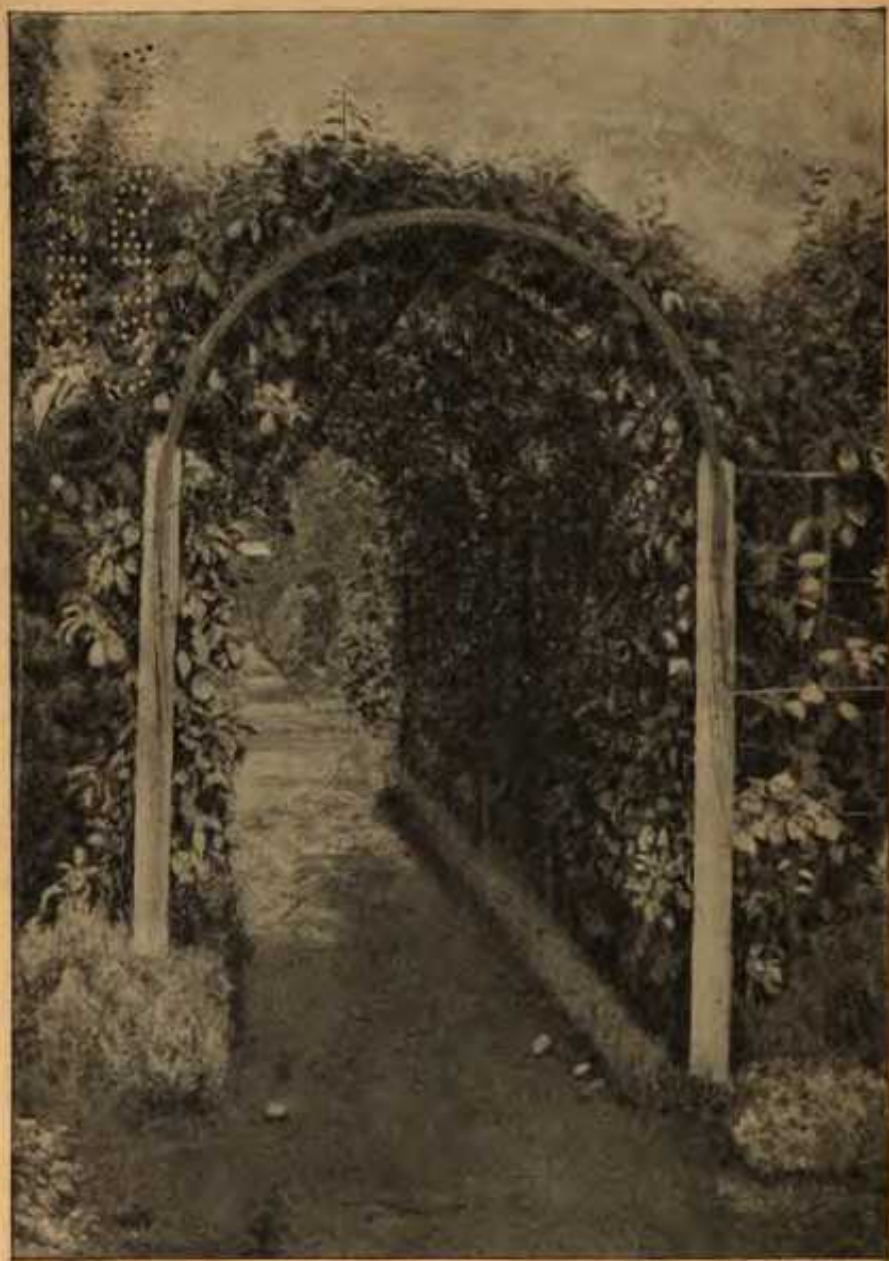
WINE ARCHWAY COVERED WITH FRUIT.