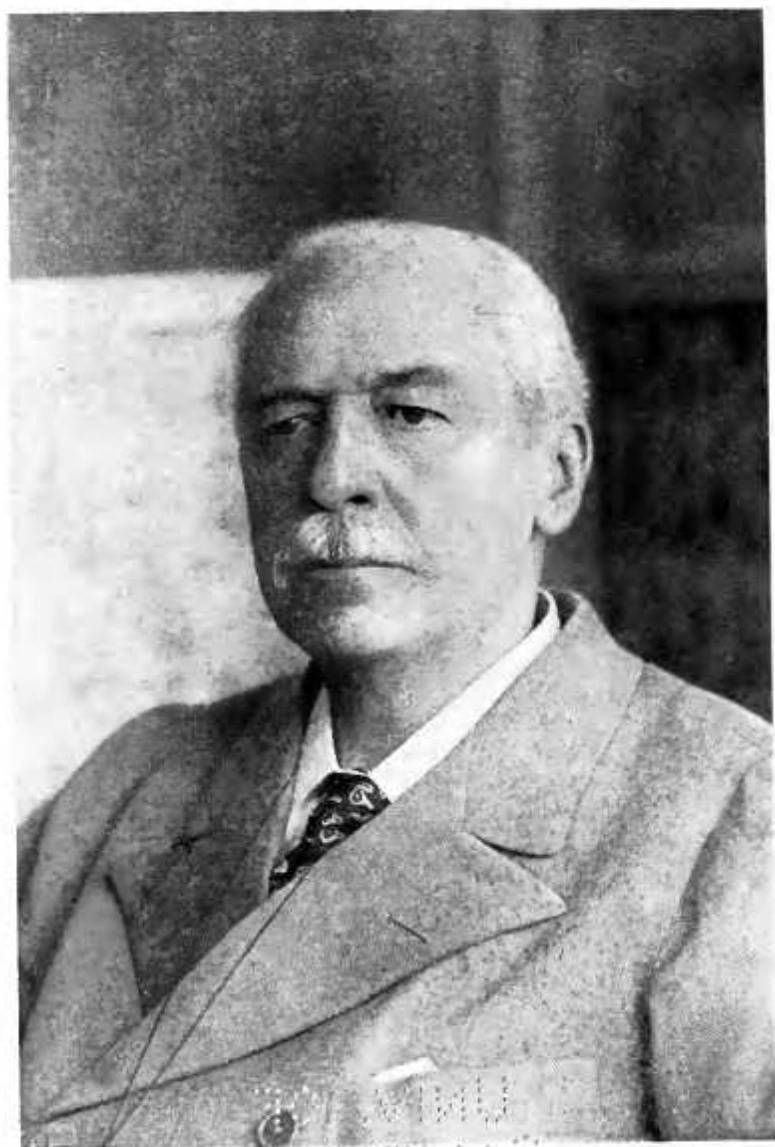
EARL OF CROMER WHEN LEAVING EGYPT