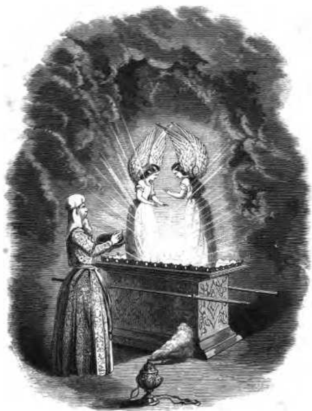
THE MOST HOLY PLACE.