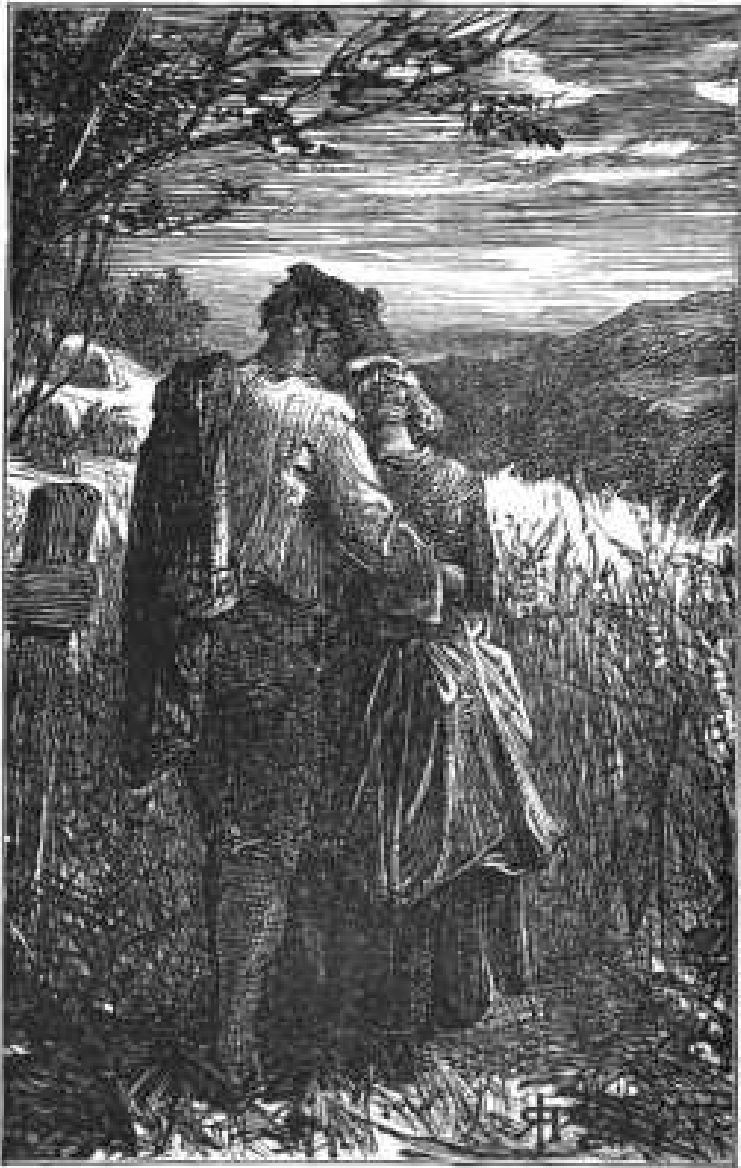
Coming through the Eye. — See page 106.