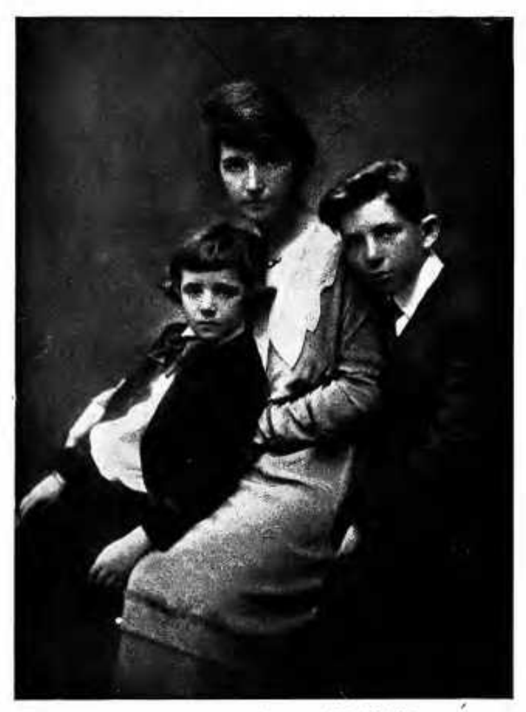
THE AUTHOR AND HER SONS