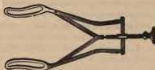
Fig. 4. Frankel's nasal speculum.

Collin's speculum (fig. 3), a double-bladed affair, with a broad, trumpet-shaped orifice, which is dilated and held open by means of a screw ar-