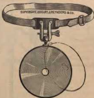
Fig. 2. Concave forehead reflector.