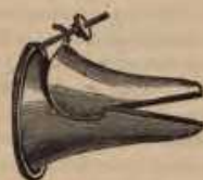
Fig. 3. Robert and Collin's nasal speculum.

essary, and is certainly advisable, although a fair examination of the parts may be made without it by simply elevating the tip of the nose with the thumb and dilating the nasal openings by pressure upon it. Of these nasal specula there are many kinds, and some prefer one, some another. The two best, perhaps, are those known as Robert and