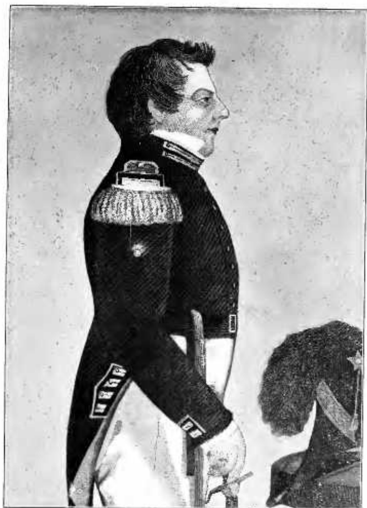
LIEUT. GEN. JOSEPH SMITH, Mormon Prophet,