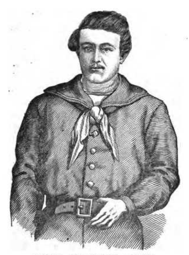
THE SAILOR BOY.