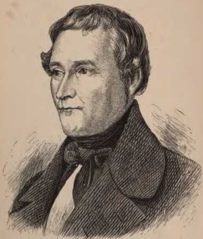
PREISSNITZ, THE FOUNDER OF THE WATER CURE.