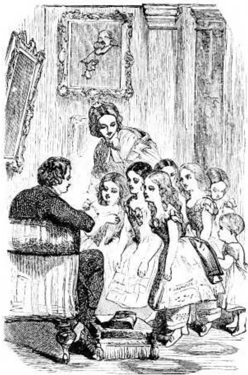
The Children coaxing Mr. Appleton to tell where Aunt Fanny lived.