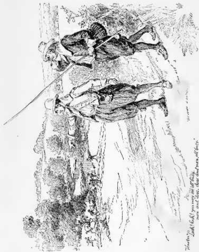
THE OTTER HUNT IN THE "COMPLETE ANGLER."