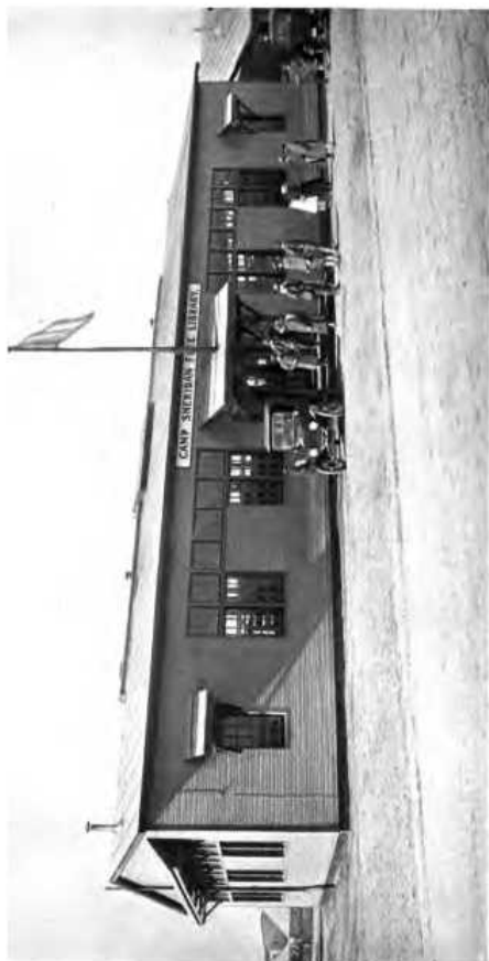
A TYPICAL CAMP LIBRARY

The library automobile is used in the collecting and delivery of parcels of books