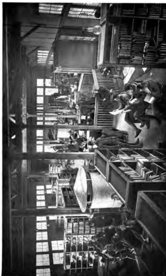
INTERIOR OF LIBRARY, CAMP SHERIDAN Typical view, showing arrangement of the bookcases, alcoves, and charging desk