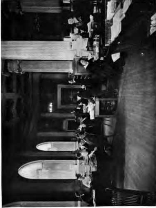
A CORNER OF A. L. A. WAR SERVICE HEADQUARTERS