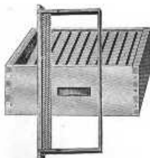
Fig. 2. Shallow Extracting Super.

quired; and, taking it all in all, it is very doubtful whether the average person will get anywhere near as good results with such hives as with those having deeper frames, of the Langstroth dimensions.