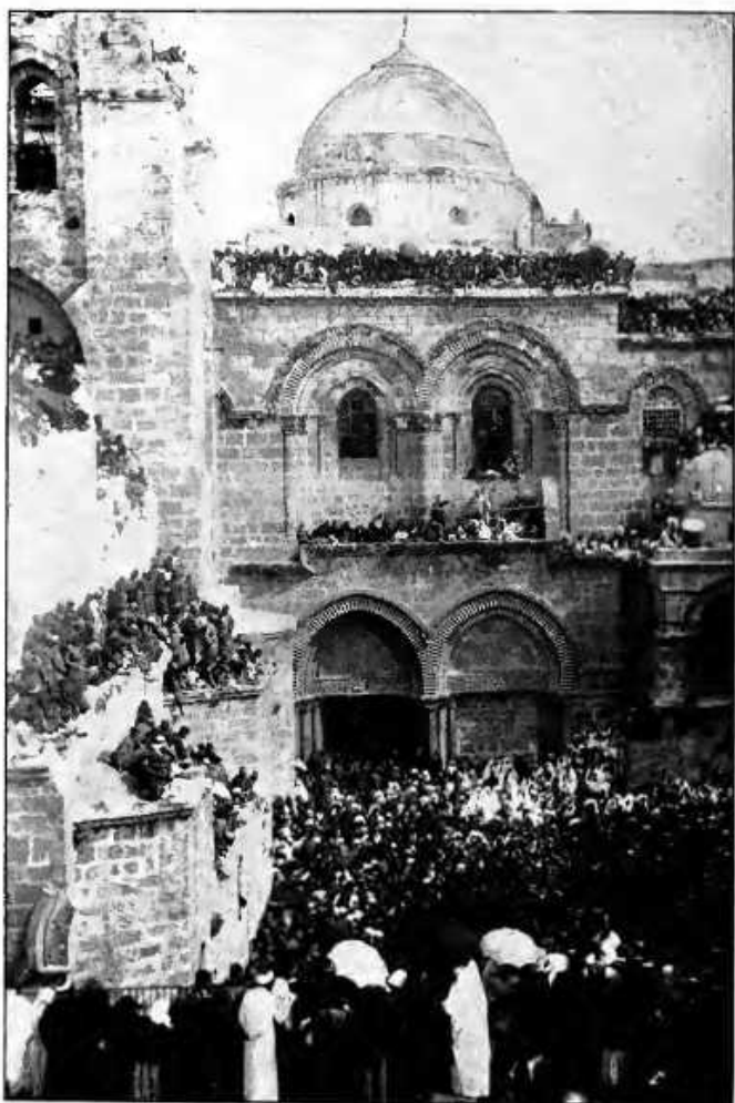
COURT OF CHURCH OF THE HOLY SEPULCHER. "Washing Feet of the Greeks."