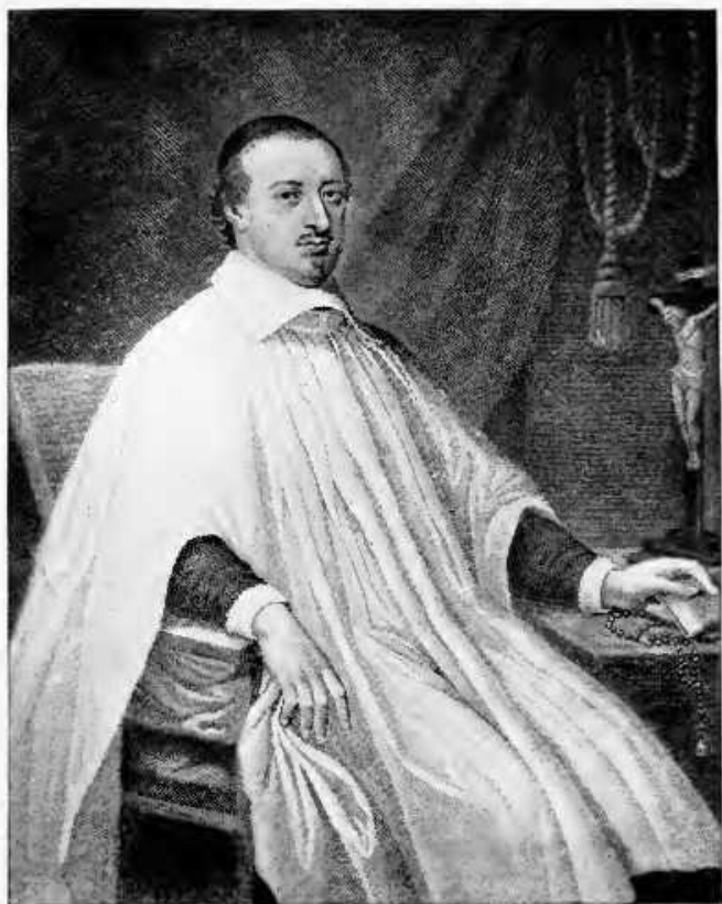
JEAN JACQUES OLIER, Founder of the Seminary and of the Society of St. Sulpice.