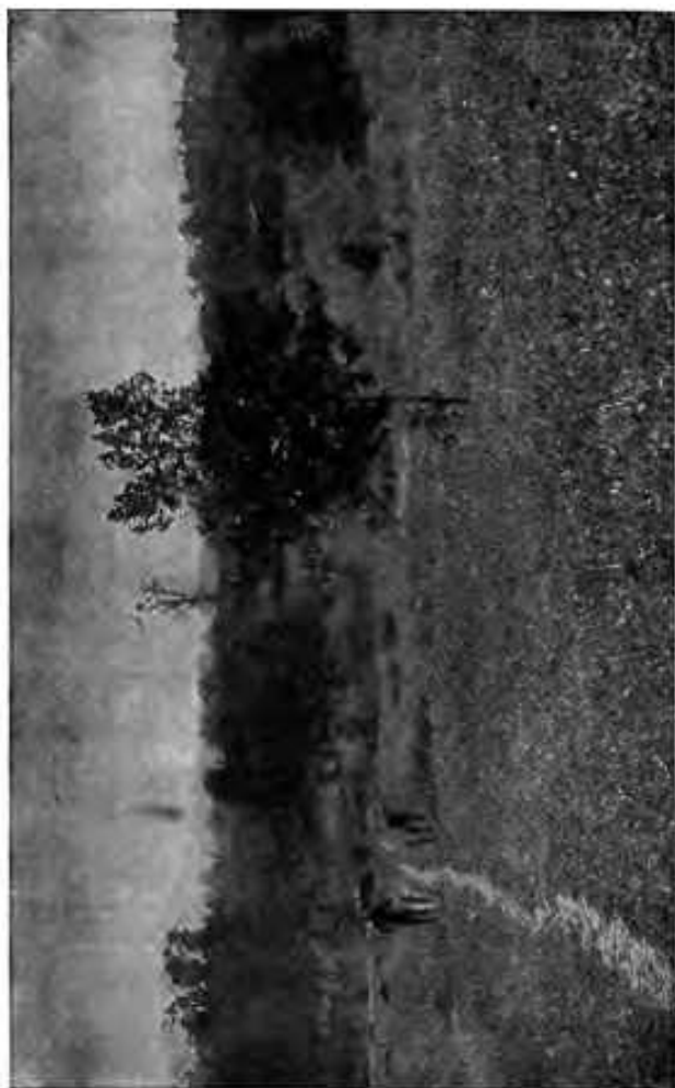
ABRAHAM LINCOLN'S BIRTHPLACE.