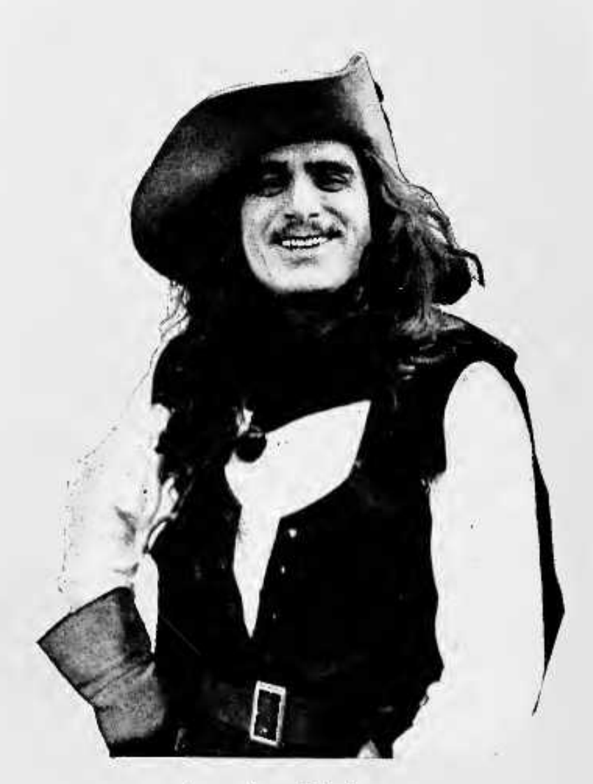
A modern Musketeer