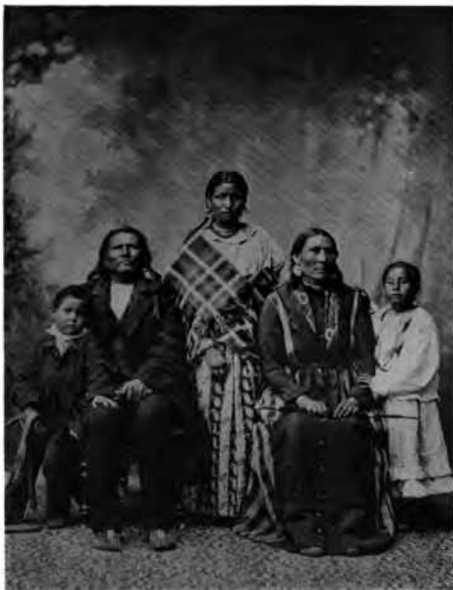
1. Ta-dó-mon-in. 2. Ma-chú-nsh-zhe. 3. Ma-hé-du-ba. 4. Suette. 5. Vo-zhún-ga-du- ('Walk-in-the-wind.) (Standing Bear.) (Sunshine.) Standing Bear's wife. ('Light of the way.) Orphan grand-son of Standing Bear. Only living child of Standing Bear. Orphan niece of Standing Be