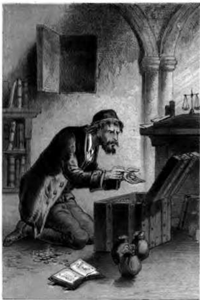
ROCHON THE MISER page 12