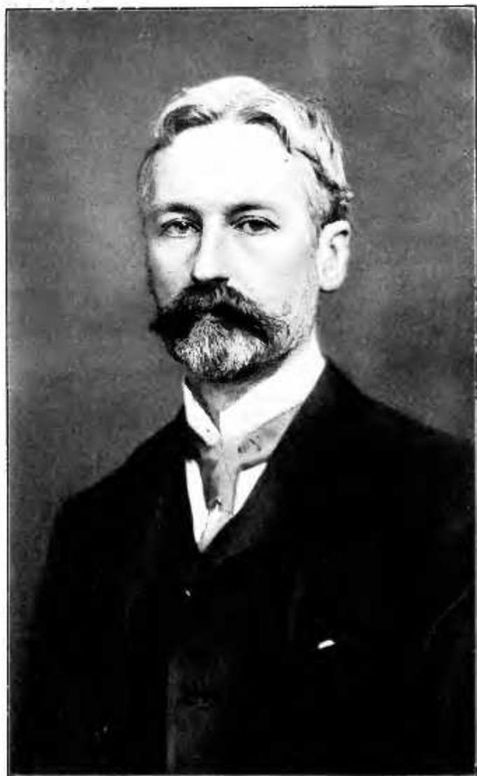
HENRY W. NEVINSON