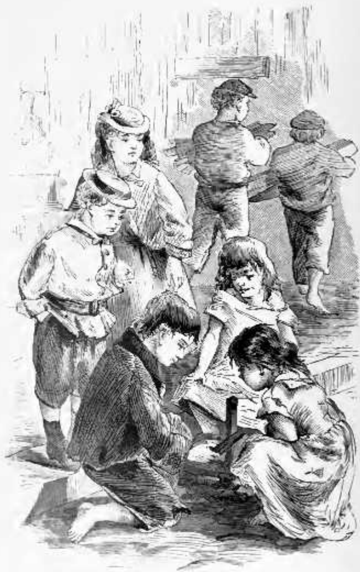
IN AMITY COURT. Page 26.