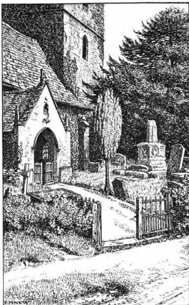
THE COUNTRY CHURCHYARD