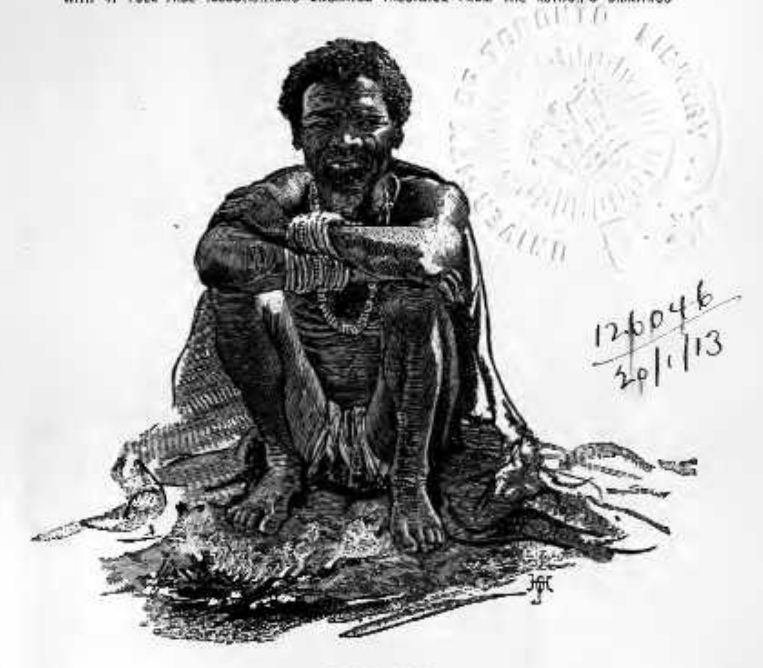
LONDON KEGAN PAUL, TRENCH, & CO., 1- PATERNOSTER SQUARE 1889

WITH 47 FULL-PAGE ILLUSTRATIONS ENGRAVED FACSIMILE FROM THE AUTHOR'S DRAWINGS