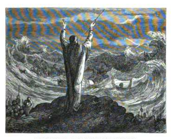
DESTRUCTION OF PHARAOH AND HIS HOST.

THOMAS NELSON AND SONS, LONDON, EDINBURGH, AND NEW YORK.