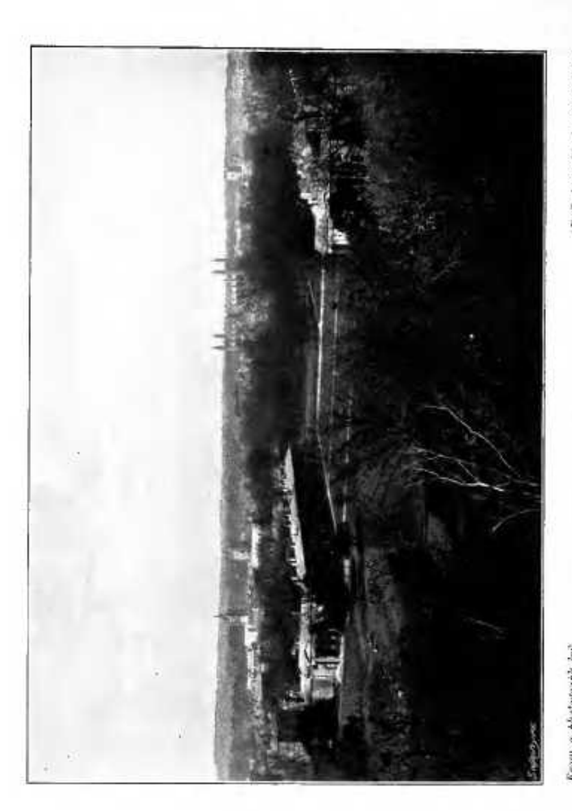
From a photograph by BIRDS-EYE VIEW OF DOWNING