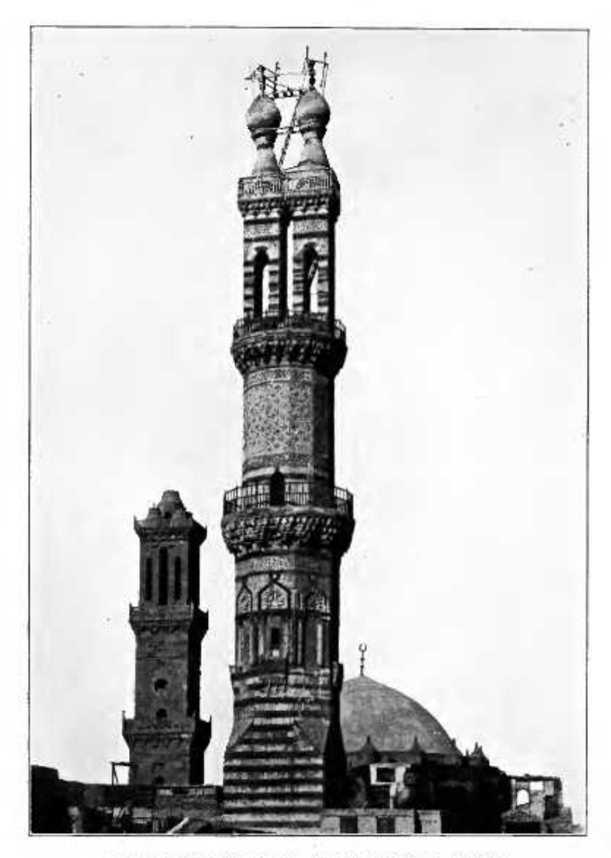
MAIN MINARET OF EL AZHAR MOSQUE, CAIRO.

El Azbar University dates from the time of the Fatimids. The original mosque was built by Jauhar in 972 A.D. It is said to have about 10,000 students and a library of 19,000 volumes.