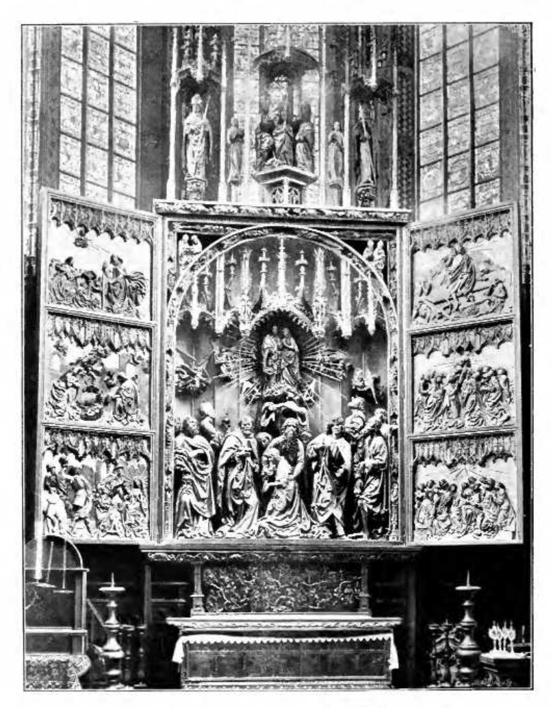
THE HIGH ALTAR IN ST. MARY'S CHURCH. (Vilus Stoss.)