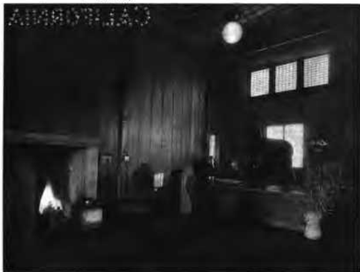
A CORNER OF THE THOMAS STUDIO, "LA LOMA," BERKELEY