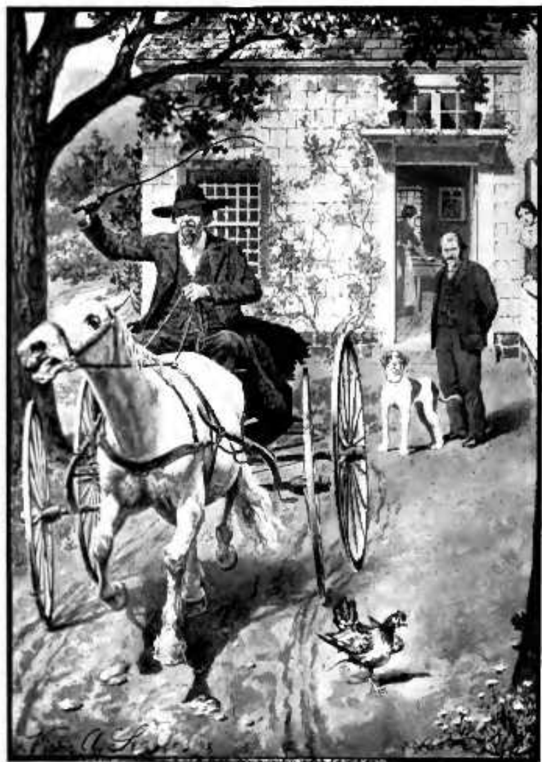
"Mr. Bemis was driving furiously." — Page 5.