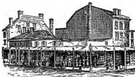
BROOKS' CLOTHING STORE, CATHARINE STREET