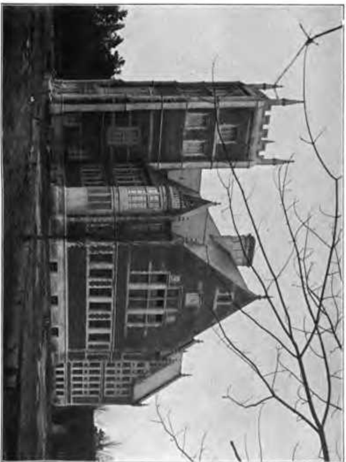
HUBBARD MEMORIAL LIBRARY, BOWDOIN COLLEGE.