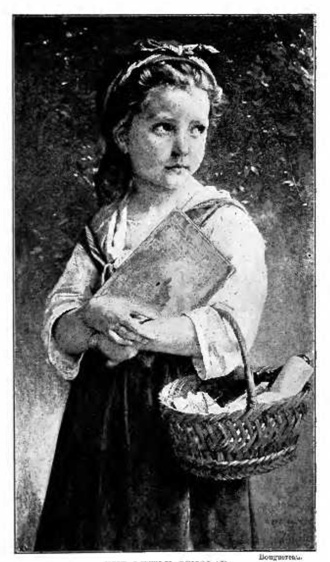
THE LITTLE SCHOLAR.