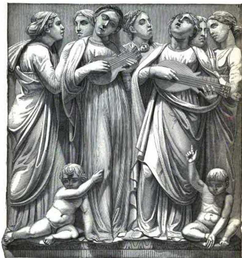
THE SINGERS. BAS-RELIEF IN MARBLE FOR THE ORGAN GALLERY OF THE DUOMO AT FLORENCE, A.D. 1431. BY LUCA DELLA ROBBIA. In the National Museum, Florence.