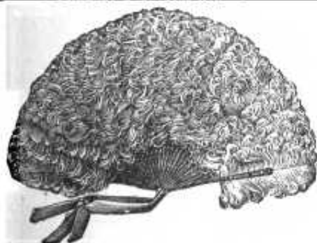
OSTRICH- FEATHER-BOAS, FANCY-FEATHER- BOAS.

HOURS FOR VISITING OF THE MUSEUMS, see Advertisement latest page.