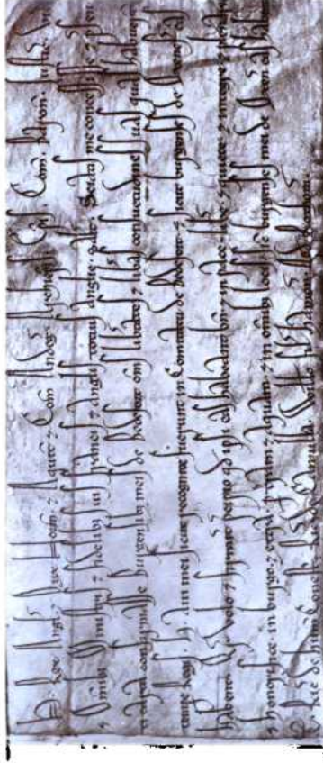
Facsimile of the Earliest Charter in the possession of the Corporation, granted in the Reign of Henry II.