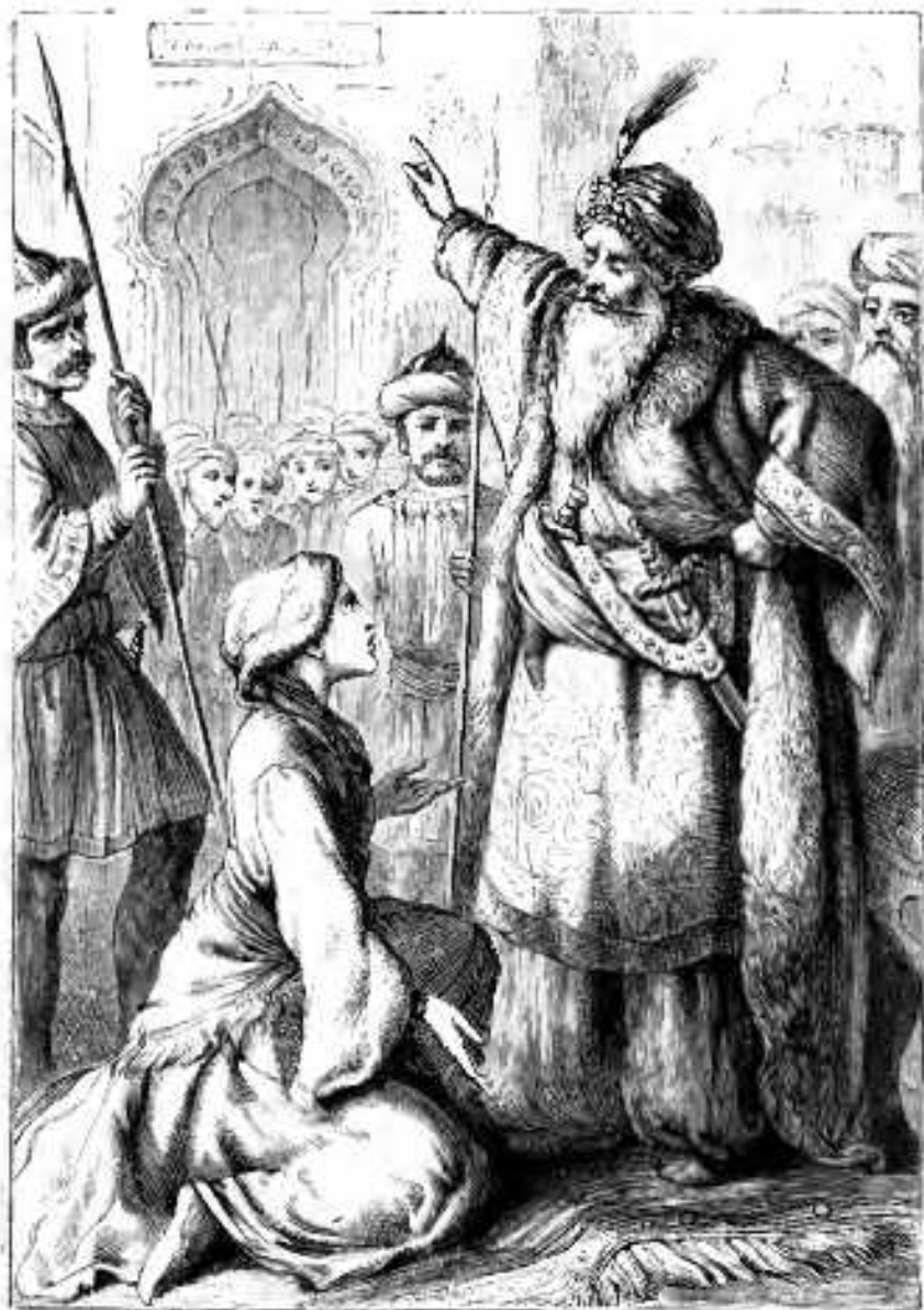
"The poor widow fell on her knees before the king, of whose slightest notice she deemed herself to be quite unworthy,"—p. 330.