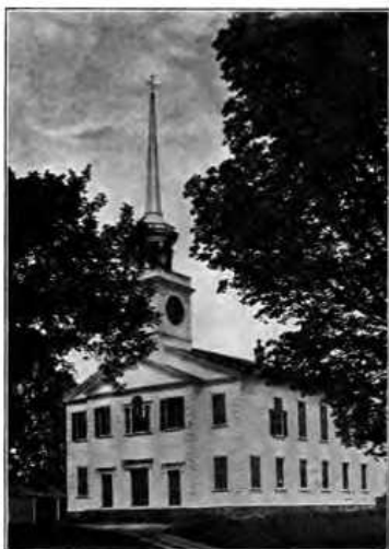
FIRST CHURCH, IN WEST BRIDGEWATER. Organized 1661.