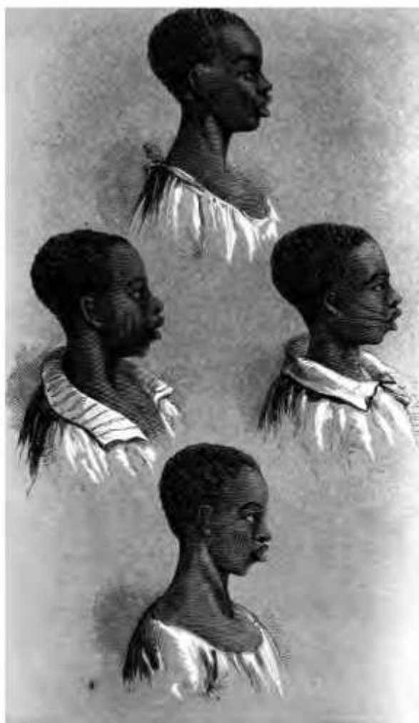
SCHOOL CHILDREN, ABBOKUTA, WEST AFRICA.